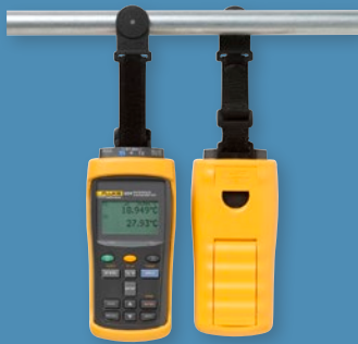
TPAK Magnetic Hanger