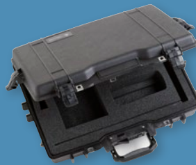
Probe and Readout Case