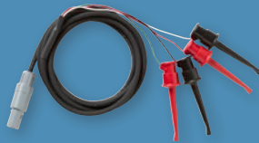
Universal RTD Adapter